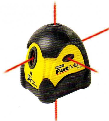
PLUMBING WITH MAGNETIC BASE