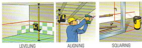
LEVELING ALIGNING SQUARING