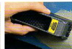
IDEAL FOR END-GRAIN WORK, AUTOMOTIVE BODYWORK REPAIR AND SHEETROCKING