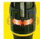
3-WAY AUDIBLE RATCHET