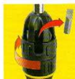
PATENTED BIT STORAGE